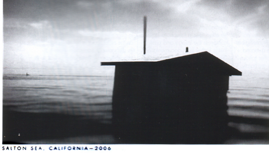
SALTON SEA, CALIFORNIA—2006