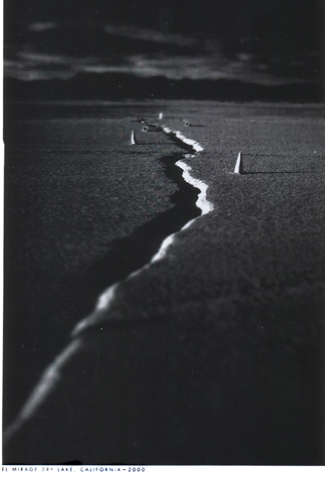
EL MIRAGE DRY LAKE, CALIFORNIA—2000