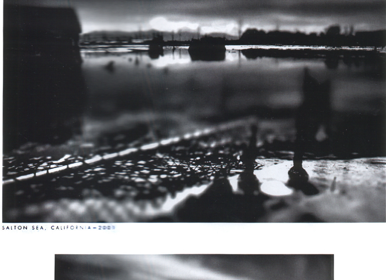
SALTON SEA, CALIFORNIA—2003